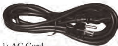
1: AC Cord