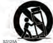
PORTABLE CART WARNING

Unplug this apparatus during lightning storms or when unused for long periods of time.